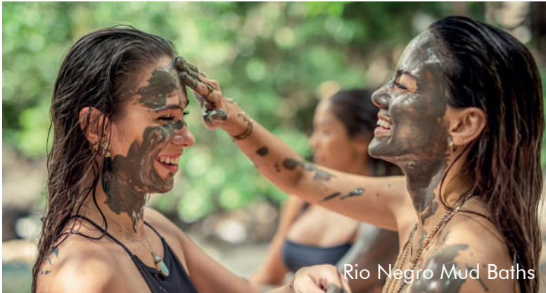
Rio Negro Mud Baths