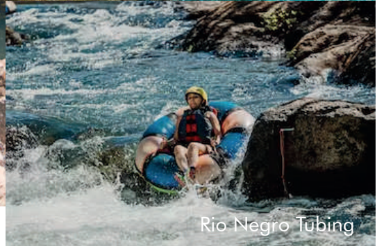
Rio Negro Tubing

Uniquely situated in the dry tropical forest, Hotel Hacienda Guachipelin is the ideal setting to explore one of the most interesting regions and active volcanoes in the “happiest country in the world” — Costa Rica. Our Hacienda in Costa Rica is the ultimate jumping off point for incredible Guanacaste, Costa Rica excursions, tours, and adventures.