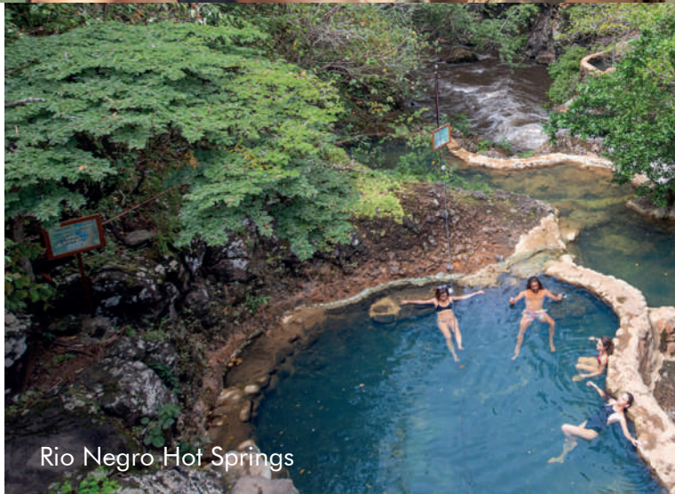
Rio Negro Hot Springs